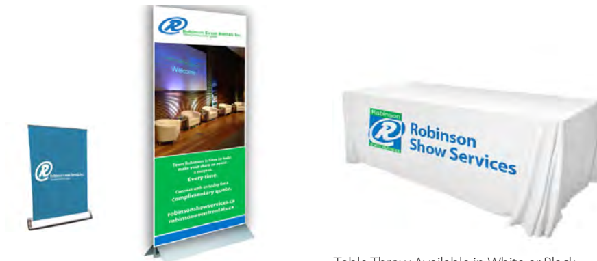
Table Throw Available in White or Black